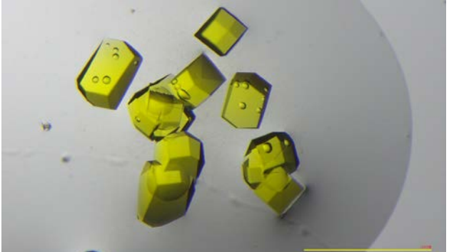
Fig. 1: Pale yellow single crystals of lysozyme containing a copper(II) complex.