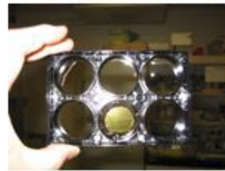
Dish used for irradiation