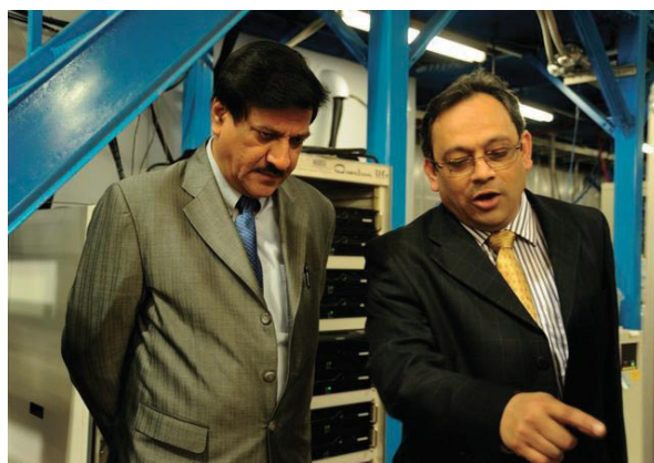
Figure 2 Shri. Prithviraj Chavan, the Minister of State (independent charge) for Science and Technology and Earth Science (left) and Prof. M. K. Sanyal, the PI of the project.

the planned experiments. Some preliminary experiments were carried out. A new 5+2 circle diffractometer was installed in November and its commissioning started (Fig 1). It is being used for powder and single crystal diffraction, reflectivity measurements. A low-temperature cell (up to 10 K) has been set up and a high-pressure cell (up to 30 GPa) is being set up on this diffractometer.