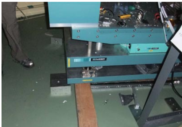
Figure 3 The derailed diffractometer after the earthquake on March 11.

the earthquake on March 11 2011. Fortunately the diffractometer itself was sound but it took several months to repair and improve the slider parts (Fig. 3). The second diffractometer will be installed by autumn at the latest.